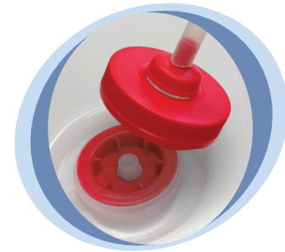
Safe Link Closed Loop Chemical Management System for easy use of chemicals and change-out